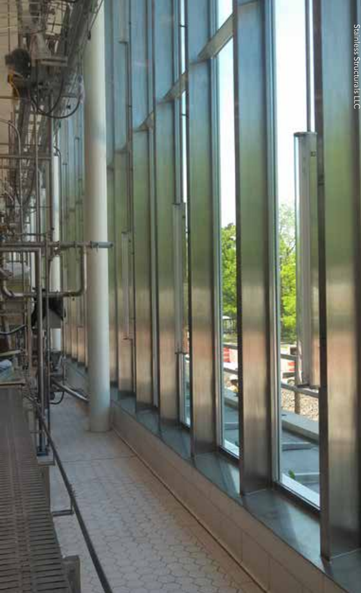
Stainless Structural is LLC