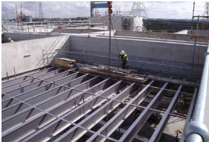
▲ Stainless steel beams at Thames Gateway Water Treatment Works.