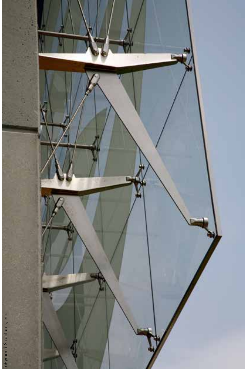
TriPyramid Structures, Inc.